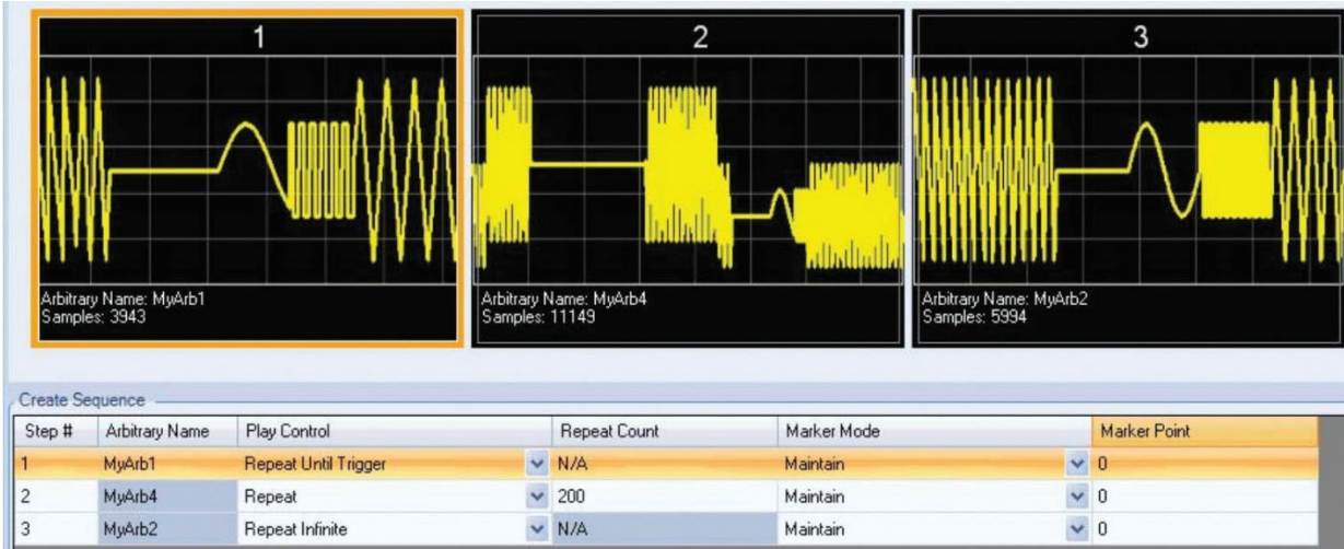
Figure 1. BenchLink Waveform Builder Pro sequencing menu.

The following is an example that uses Keysight BenchLink Waveform Builder Pro to build a new signal from a library of arbs.